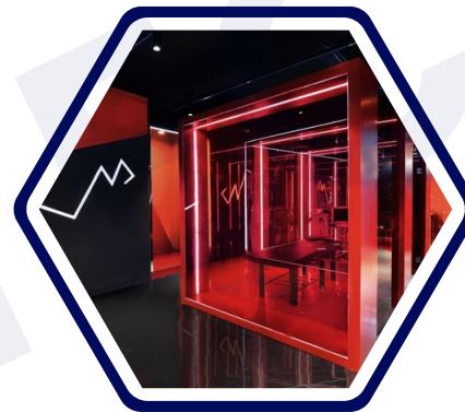
M Modern company for Joinery