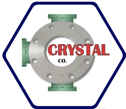
M. Crystal Contracting company for coatings